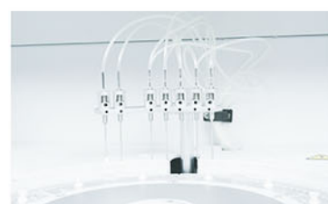
Washing Probe Independent 7-step washing system.