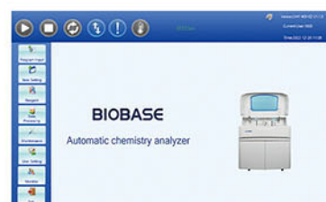
Software User-friendly software.