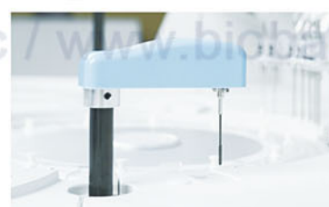
Mixer Probe Teflon coating to avoid cross contamination.