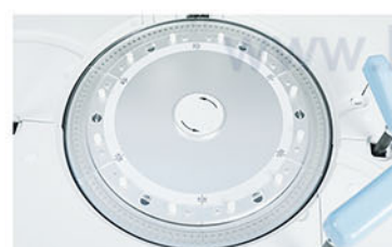
Reaction Tray 37±0.1°C, real-time monitor.