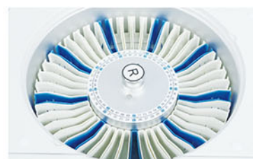
Reagent Tray 2~8°C cooling for 24 hours.